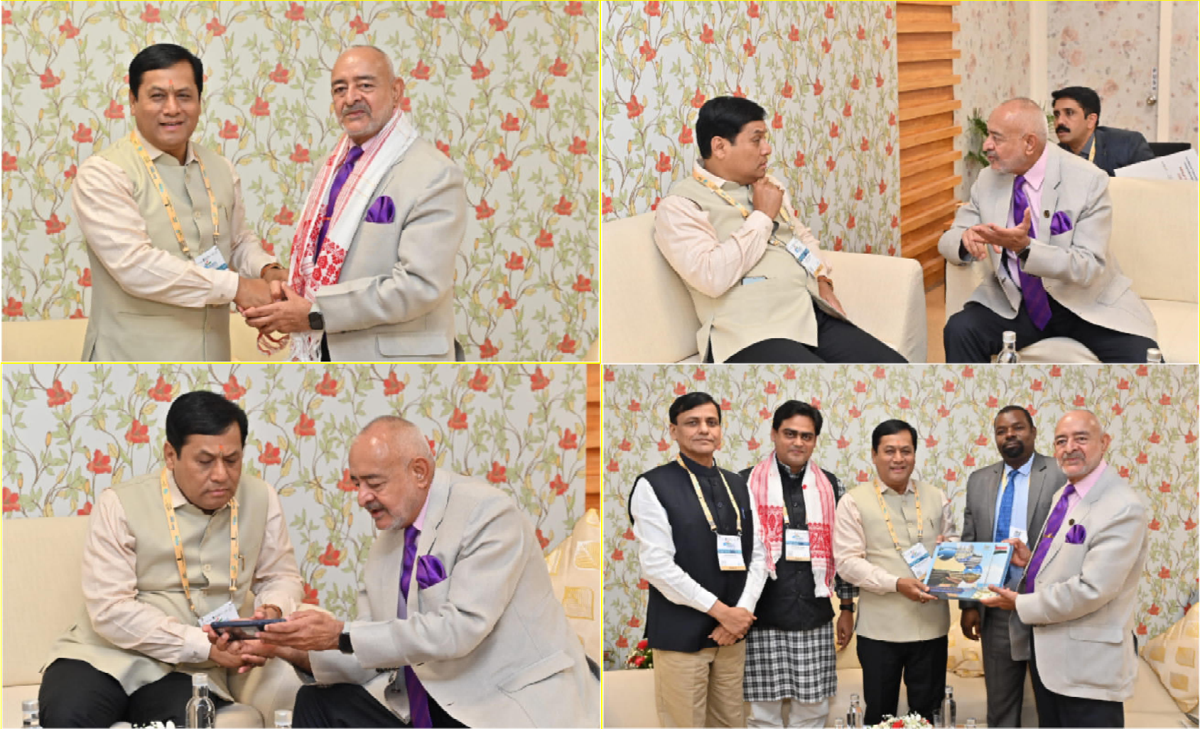
Admiral D K Joshi, PVSM, AVSM, YSM, NM, VSM (Retd.), Hon'ble Lt. Governor, A&N Islands and Vice-Chairman, Islands Development Agency on visit to Mumbai for 3 rd Global Maritime India Summit 2023 met Hon'ble Union Minister for Ports, Shipping and Waterways, Gol, Shri Sarbananda Sonowal in the presence of Hon'ble Minister of State for Home Affairs, Shri Nityanand Rai & Hon'ble Minister of State for Ports, Shipping and Waterways, Shri Shantanu Thakur today. Discussed fast tracking strategic mega projects of Ministry of Ports, Shipping and Waterways including International Container Transshipment Terminal at Great Nicobar Island and developing A&N Islands as Regional Ship Constructions/Repair Hub in Indo Pacific.